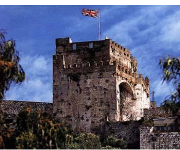
19. Which important building has been left behind from the Arab World?